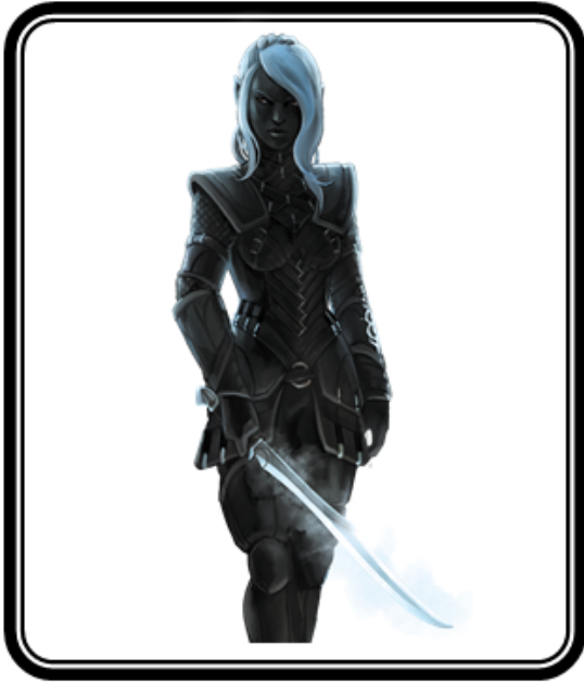
Kayleth Tor'Erhyl (kay-leth tor-ay-hill) Sword Dancer

Personality: Kayleth is a high-ranking member of the House Tor'Erhyl. Extremely independent, Kayleth was chosen as the one to make contact with the surface to prevent the most recent slave-taking raid. While graceful and acrobatic in combat, Kayleth is often direct and serious when she speaks. (Kay-leth-tor-ay-hill) – Drow Female Sword Dancer of Ellistraee