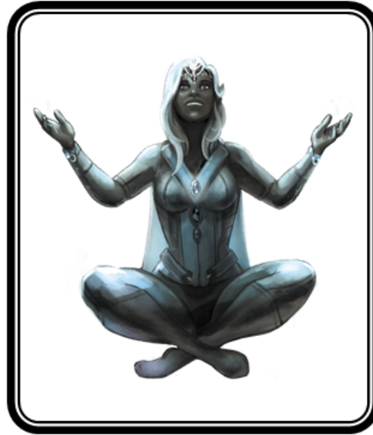
Meriele Tor'Erhyl (merry-elle tor-ay-hill) Matron of House Tor'Erhyl

Personality: Meriele Tor'Erhyl looks youthful (early 20s in human terms) but is over 200 years old. Typically, she smiles brightly and speaks excitedly. Her mannerisms mask a cunning and calculating mind and though the deception is not entirely malicious, neither is it incidental. (Merry-elle-tor-ay-hill) Drow Female, Matron of House Tor'Erhyl